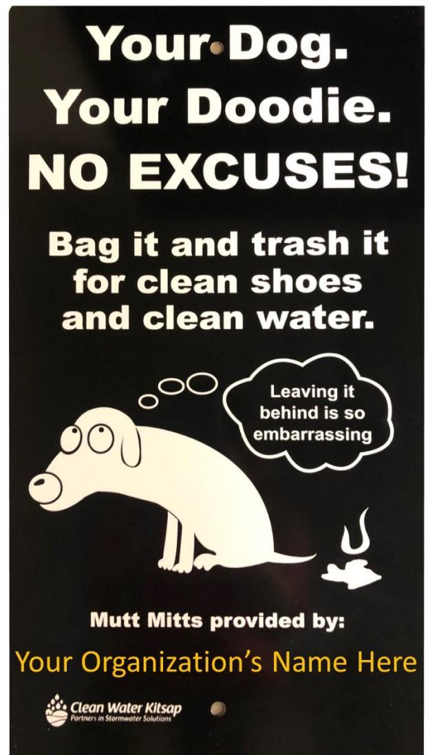
Figure 1 - Current sign for pet waste stations.

The sign accompanying each station (Figure 1) is outdated and in need of a refresh. Additionally, Kitsap's program—and other pet waste programs in the Puget Sound region—has been in existence long enough that attitudes, beliefs, norms, and behaviors surrounding pet waste have likely evolved.