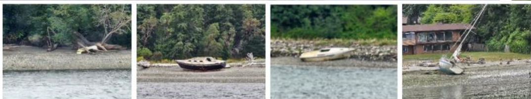
1 2 3 4