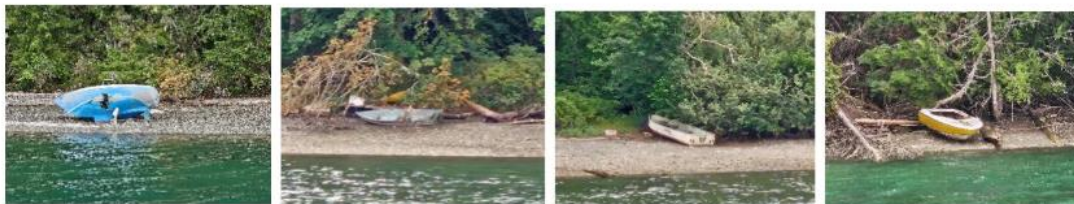
5 6 7 8