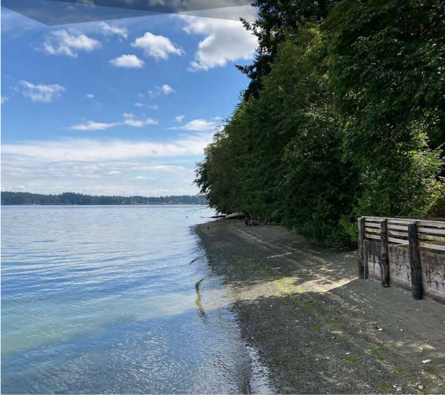
ILLAHEE STATE PARK, WA