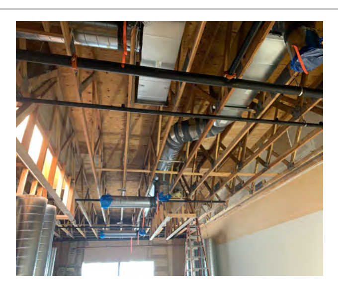
Installed ductwork and fire sprinkler system