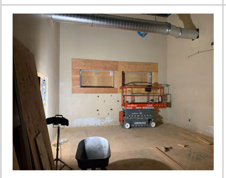
Framing of interior windows