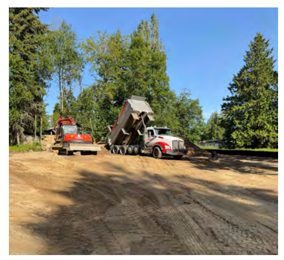
Grading for sidewalk, picnic area, and children's playground

Installation of heating, cooling ductwork, and electrical rough-in are on schedule. Inspections will take place for framing, plumbing, electrical work that is completed. Scheduling for installation of drywall and insulation is underway. Delivery and installation of replacement doors and windows is also scheduled. Fire sprinkler assembly continues to progress throughout the facility. Preparations are underway for concrete pours for sidewalks, a picnic area, and stairway on the north property. Coordination with utilities on site for upgrades and connections. Utilities include Puget Sound Energy, West Sound Utility District, and Cascade Natural Gas.