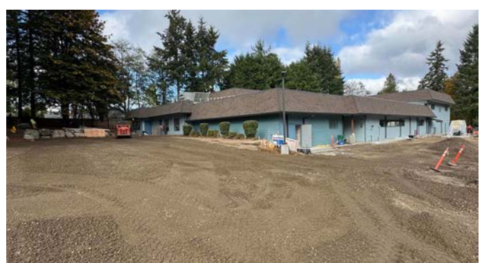
Grading and compaction for the parking lots